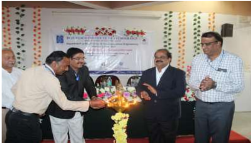
Inauguration of OBE Programme