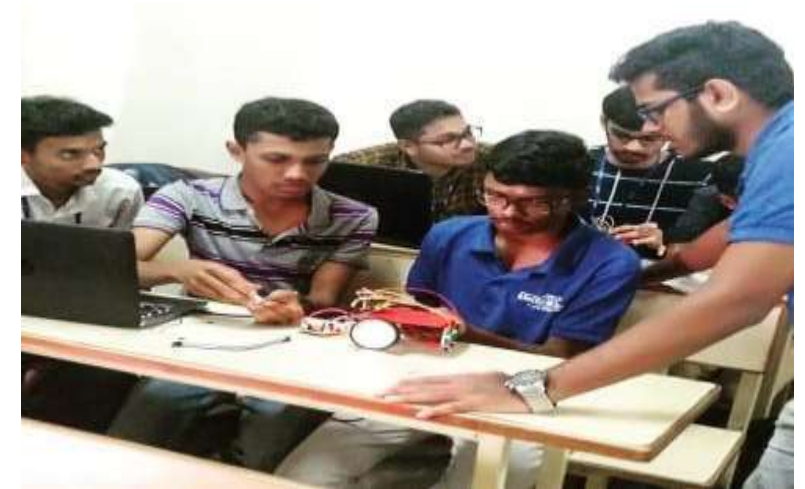
Students working on their models