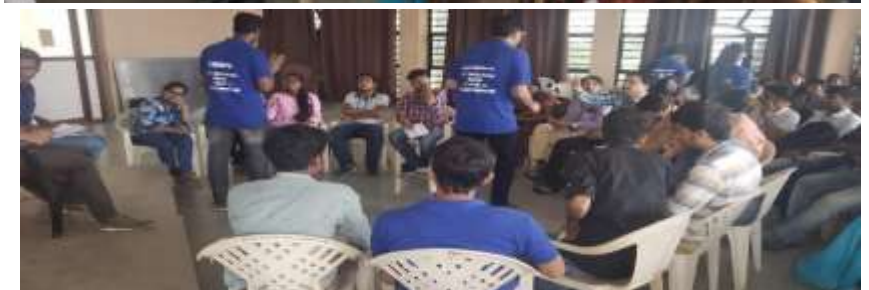
Heated argument between the lawyers